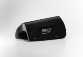
Medium – left.