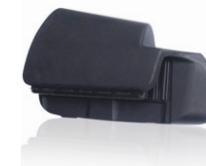
Medium cut – right and left. Cut out section for longer bolts.