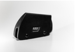
High – right.