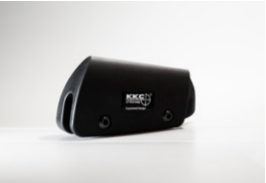
Medium – right.