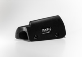
Medium cut – left. Cut out section for longer bolts.