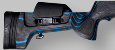
KKC Black and Blue