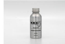
For durable treatment of wood.