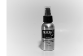
For maintenance and polishing of all wood parts and metal components.