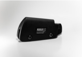
Medium cut – right. Cut out section for longer bolts.