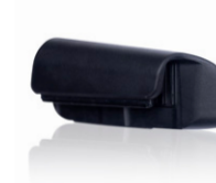
Low – right and left.