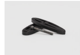
Two 8mm spacers and longer screw.