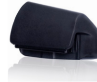
Medium – right and left.