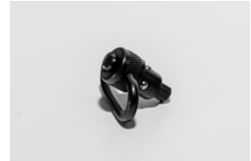
Push Button Swivel with Hex Key, cup and screw.