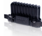
E-flex base complete Can be used for right and left.