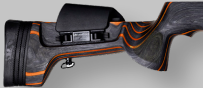
KKC Black and Orange