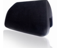
High – right.